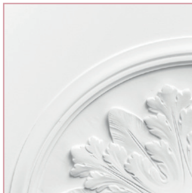
Excellent for use during render applications