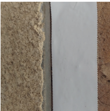
Waterproof with a good hold on brick surfaces