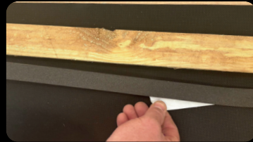
STEP 2 - APPLY TO SURFACE