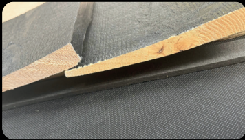
STEP 3 - WAIT 2-3 HOURS