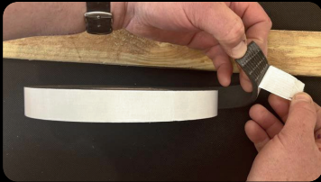
STEP 1 - PEEL THE BACKING