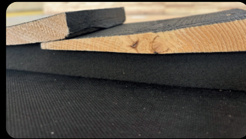
STEP 4 - TAPE HAS FILLED GAPS