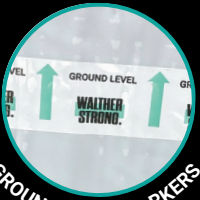
GROUND LEVEL MARKERS