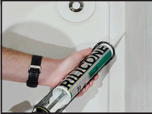
Step 1 - Apply our reliable Silicone in an even bead