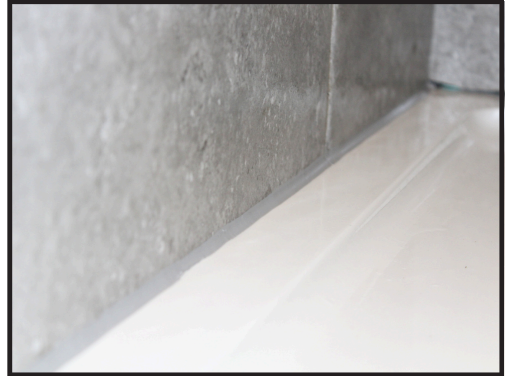
Step 4 - Allow silicone 24 hours to fully cure