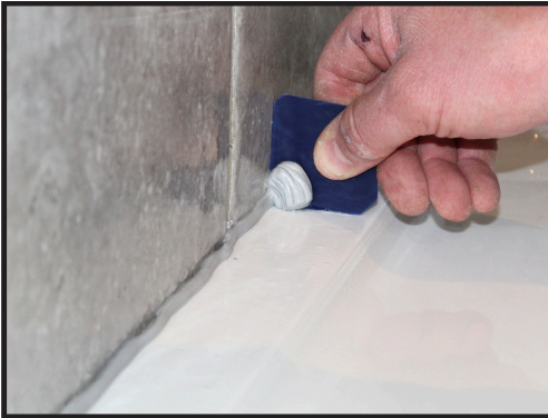
Step 3 - Run RILICONE joint spatula down bead, pressing firmly