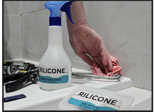
Step 2 - Spray bead evenly with RILICONE smoothing spray