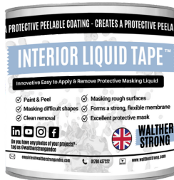
1 LTR WSLT-PRO1