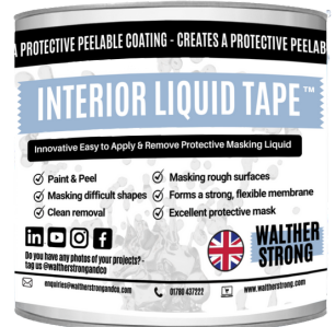
2.5 LTR WSLT-PRO2.5